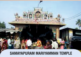
SAMAYAPURAM MARIYAMMAN TEMPLE